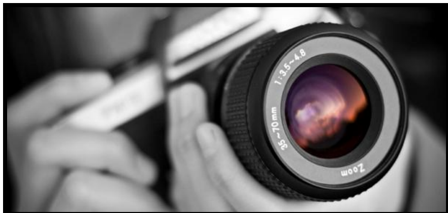
Photo & Dimension

A juried exhibit for photographers and 3-D artists.